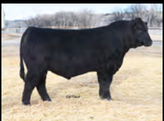
LBRS Genesis- Sire to 103C Flush Brothers

If you are looking to get in on 103C genetics; don't wait. Unfortunately we lost 103C to a lightning strike this summer. We did flush her one more time this spring to LCDR Anthem with those calves coming this spring.