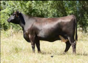
Hook's Geneva 2G - Dam of 402M