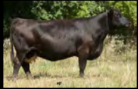
A22 - Dam of 420M

ASA# 4338650 GIBBS 7382E BROAD RANGE DOB 2/7/24 GIBBS 9114G ESSENTIAL ADJ BW 84 GIBBS 7153E STAR 3136A ADJ WW 710 HART FINAL ANSWER 0048 CCSK HOMETOWN HONEY A22 Y76