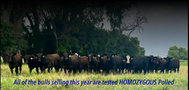
All of the bulls selling this year are tested HOMOZYGOUS Polled

We feel this style of development will suit these bulls for the long haul.